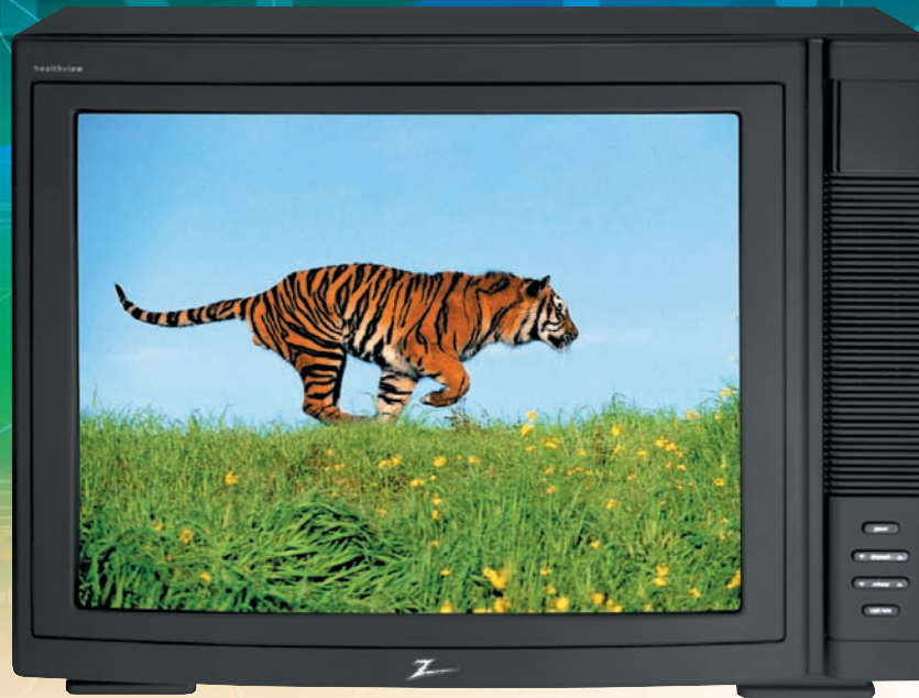
20" Remote Control Color TV H20J55DT